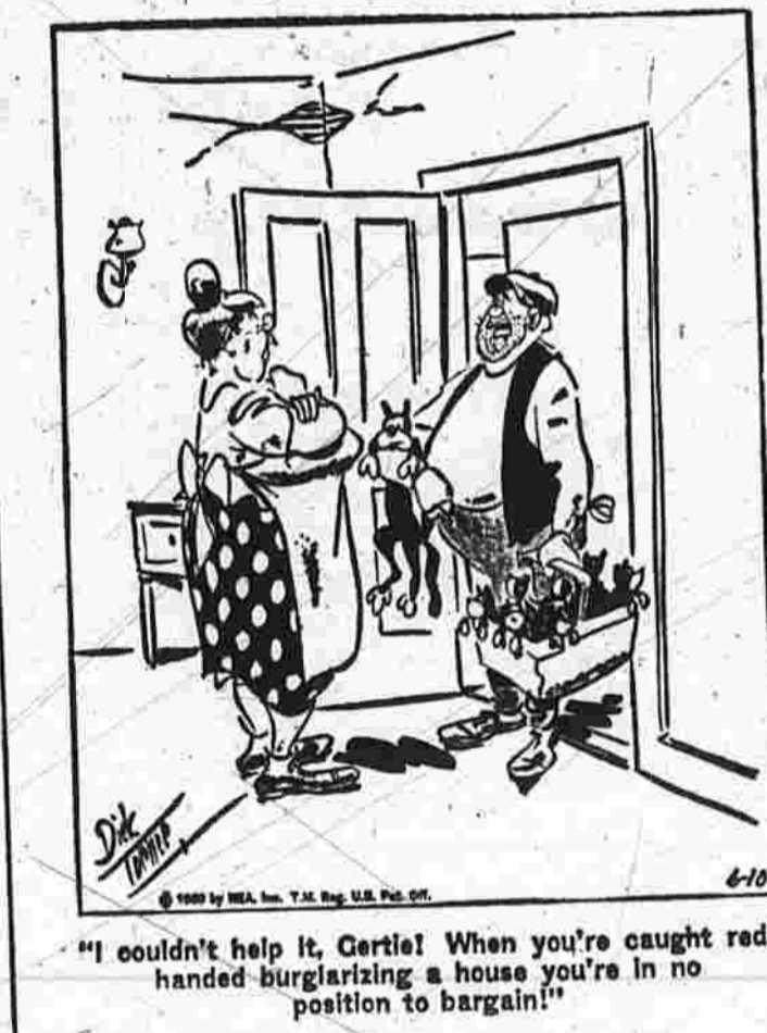
LITTLE SPORTS BY ROISON