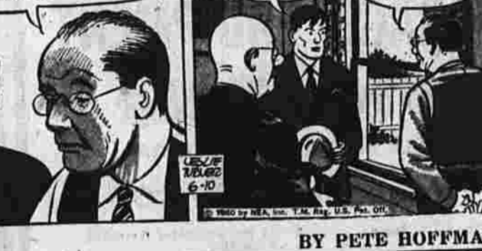
BY PETE HOFFMAN