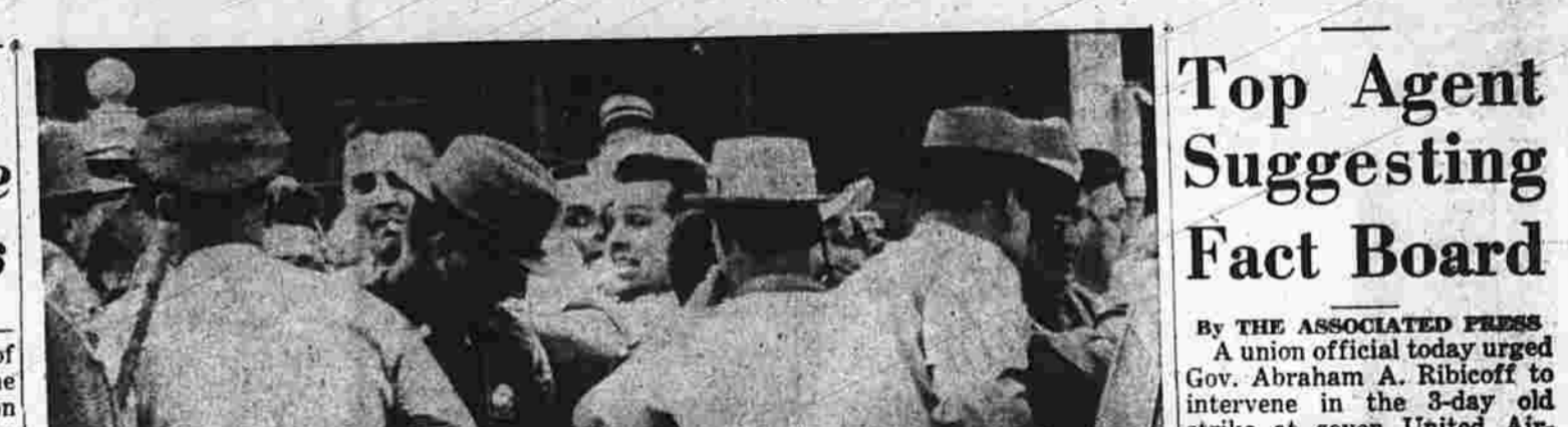
Gov. Ribicoff and other officials at a press conference today.

East Lansing, Mich., June 10 (AP)—A letter received by Michigan State University today said that a mother whose 3-year-old son, recently adopted, had been kidnapped by a stranger and whose father for his work as a roofer.