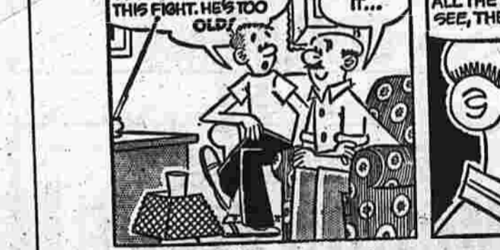
CAPTAIN EASY BY LESLIE TURNER