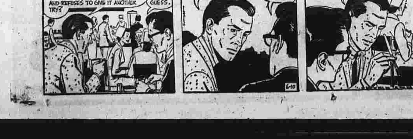
THE STORY OF MARTHA WAYNE